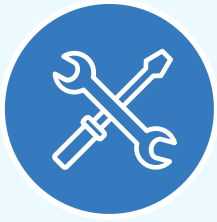
Repairs & Maintenance