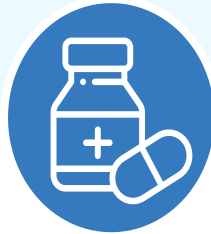
Biosimilars & Drug Implementation