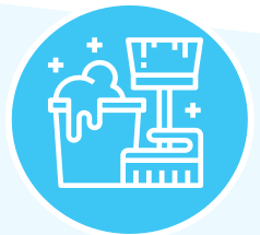
Clinical & Non Clinical Cleaning