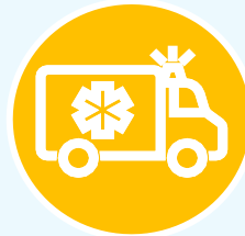
Patient Transport Services