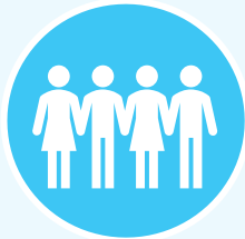
Nurse Agency & Locum Doctor